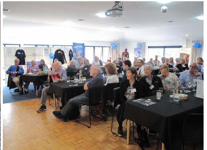
An attentive audience