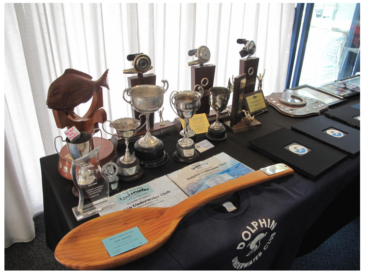
Dolphin's club trophies