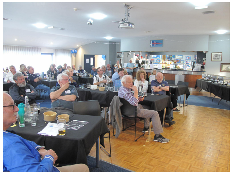
A view from the other side