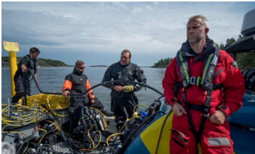
‘It’s a Baltic problem’: the Swedish coastguards saving shipwrecks from looters

The divers had been searching the seabed for sunken ships for years “out of pure curiosity” when they came across the wreck. They said the discovery of the sealed clay water bottles helped them determine that the vessel had capsized in the second half of the 19th century.